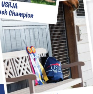
USHJA Outreach Champion