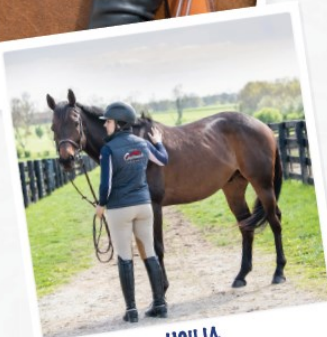
USHJA Outreach Champion