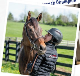
USHJA Outreach Champion