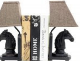
Reserve Champion Prize

Pair of filly horse head 16" book end lamps in a deep bronze finish, topped by complementing herringbone shades. Valued at $160