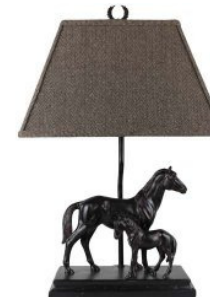
Third Place Prize

Pair of filly horse head 16" book end lamps in a deep bronze finish, topped by complementing herringbone shades. Valued at $160